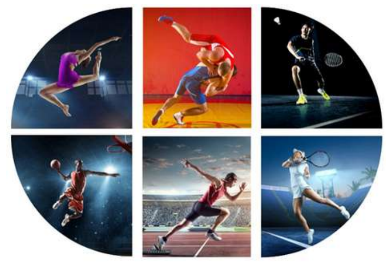
*Participating organizations may vary depending on the circumstances.

The goal of MASTER PE WORKSHOP program is to empower local PE teachers with advanced, sport-specific training that enhances their skills and knowledge. By collaborating with experts from various International Federations, the program ensures that teachers gain both theoretical and practical expertise tailored to each sport. This approach aims to optimize athletes' performance while prioritizing their physical and emotional safety, enabling teachers to foster a safe, supportive, and effective training environment.