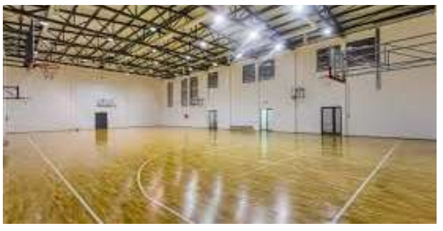
More information about Competition venues will be published in Bulletin 2